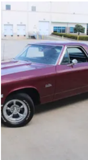
1968 Chevrolet $29,000