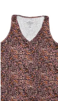
NEW Torrid $15