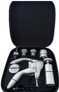
Houdini Lever Corkscrew Wine $28 LIBBY B. | sellwild.com