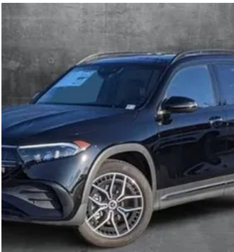
2023 Mercedes EOB $47,966 MYEV M. | sellwild.com