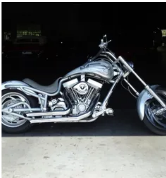
2003 Bourget Low Blow $11,000 GATEWAY C. | sellwild.com